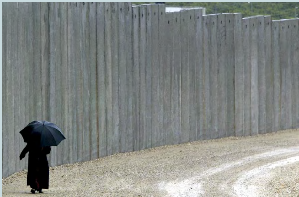
The Separation Wall.

More than 5,000 patients were screened for diabetes and, out of these, 400+ received laser treatment ‘in the field’ and about 1,400 were referred back to the main Hospital, primarily for surgery. Thanks to the dedication of the Mobile Outreach Teams, and the grants which have funded their work, many more people have had their vision saved and/or restored, and the potential burden on society has been markedly reduced.