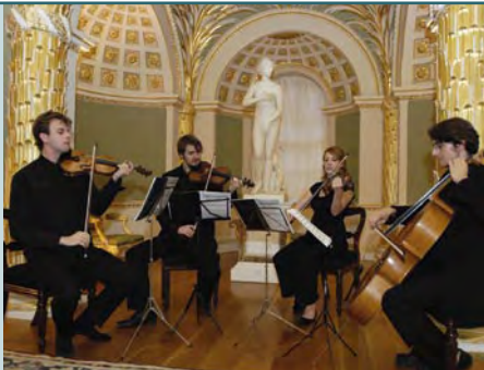
Over 150 guests enjoyed the beautiful surroundings of Spencer House for the Chairman's Reception in 2006.

2006 saw the establishment of a new fundraising and communications team in London and in Jerusalem.