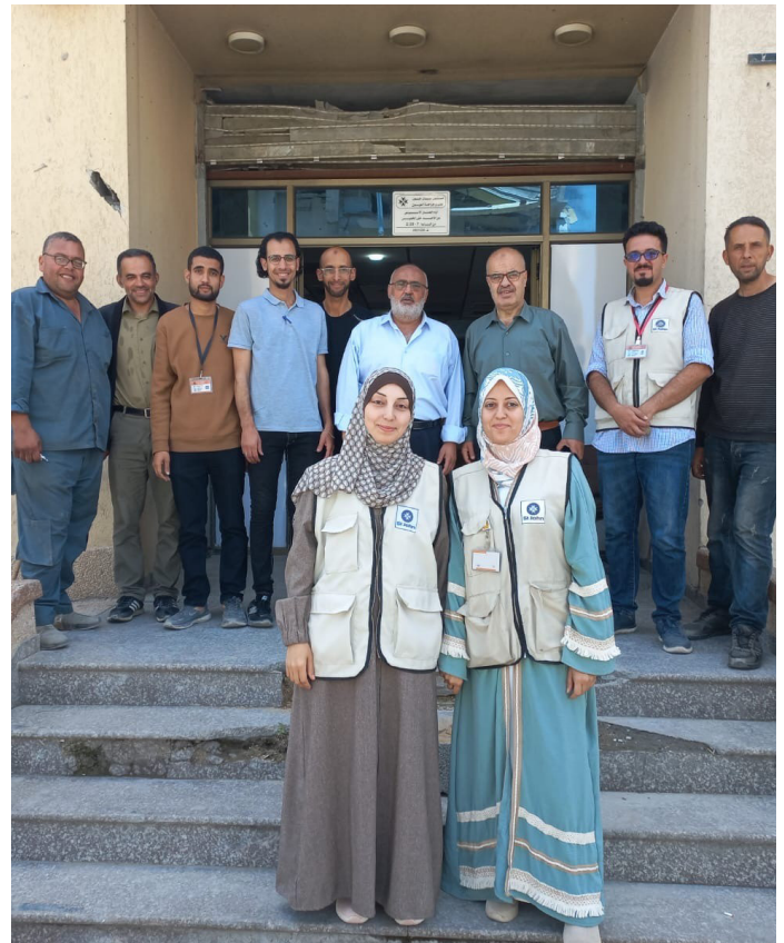
SJEHG Gaza Hospital Staff, 2025

Please include a cover note with your name, address, contact details, and a brief description of how the funds were raised.