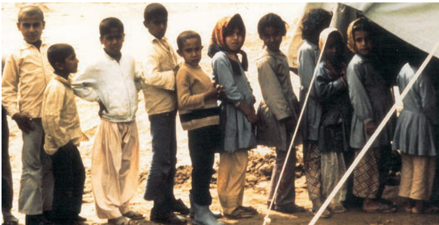
Children line up for an Outreach Clinic, Bedouin village, 1980s