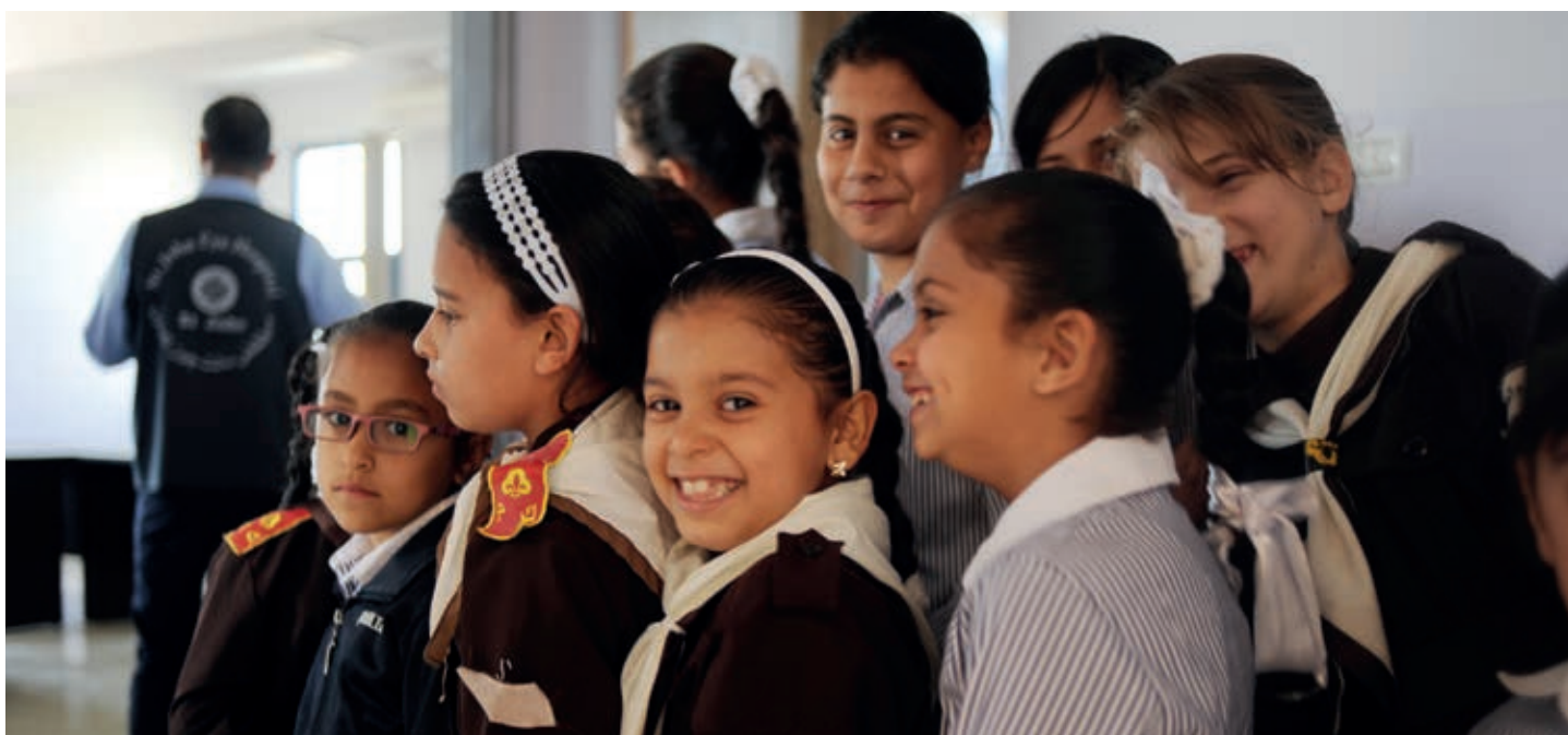
Children line up for an Outreach Clinic near Jericho thirty years later